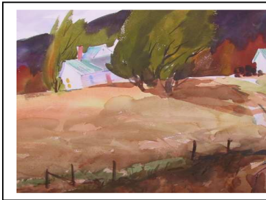
John Hewitt "Side by Side" Watercolor & Oil

* Please note different venue location for this month