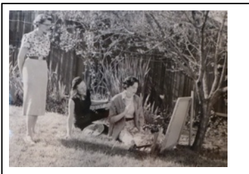
“Preparing for the Show” c. 1958

As part of our 60 th Anniversary Celebration next year, MCAA will sponsor a juried art exhibit in the main gallery of the Grace Hudson Museum. A “Call to Artists” will be mailed separately to each member shortly!