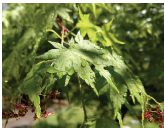
And a last little bit of rain for the season!