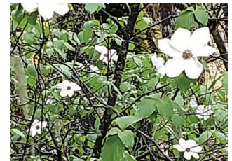
Enjoying the bumper crop of dogwoods in the forests!